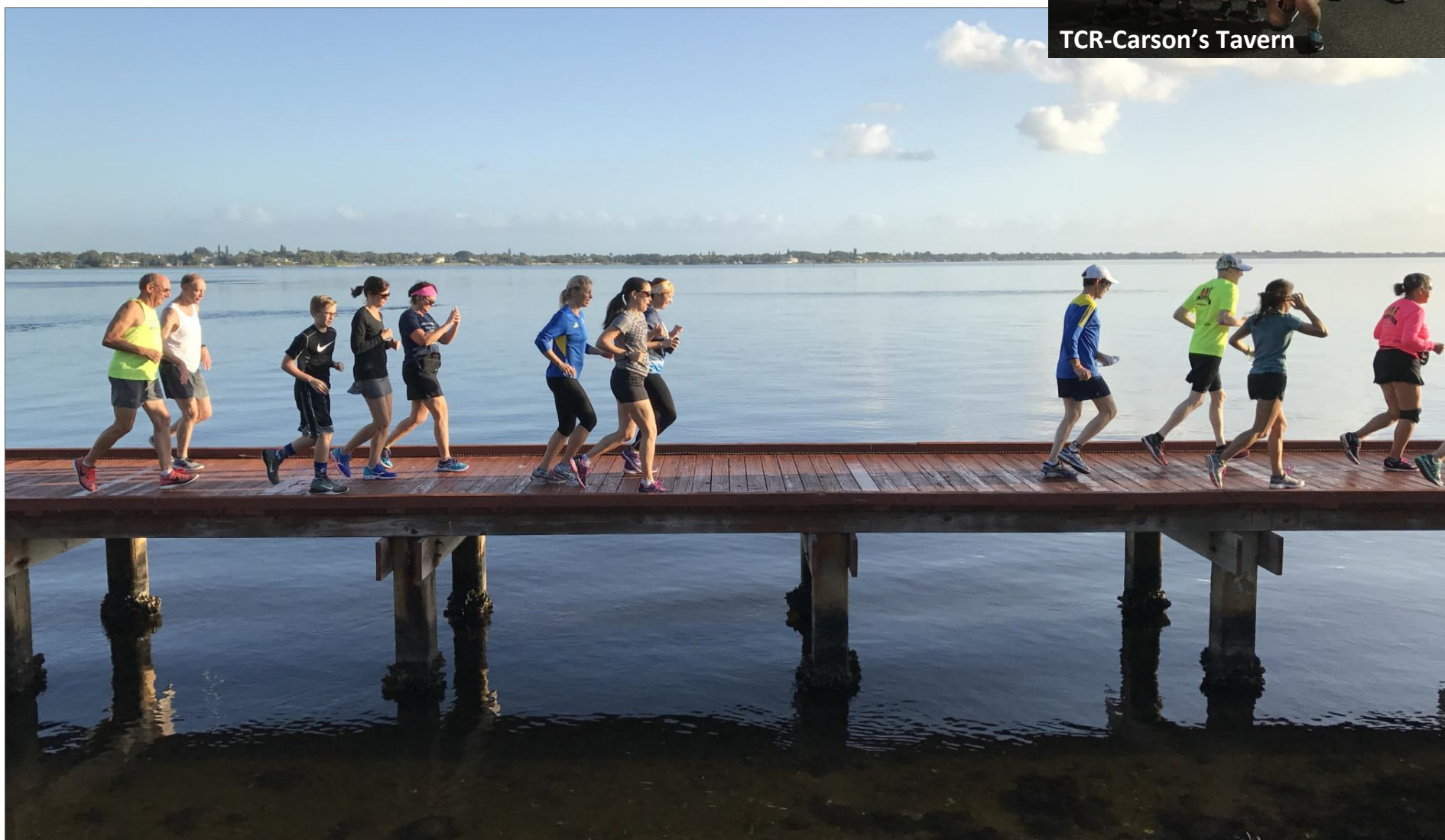
New Year's Day got off on the right foot for Treasure Coast Runners at the annual TC Running New Year's Day Fun Run and Pot Luck Social at Flagler Park in Downtown Stuart. Runners from the club shown here started out at 8am on the unofficial 3-mile route across the Stuart Boardwalk, part of the Boston-Qualifying route of the Marathon of the Treasure Coast coming up on March 5, 2017.