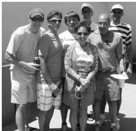
A handsome group of Striders