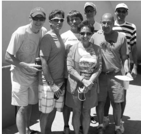
A handsome group of Striders