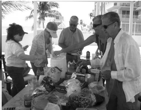
Ready to eat!