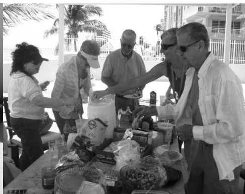
Ready to eat!